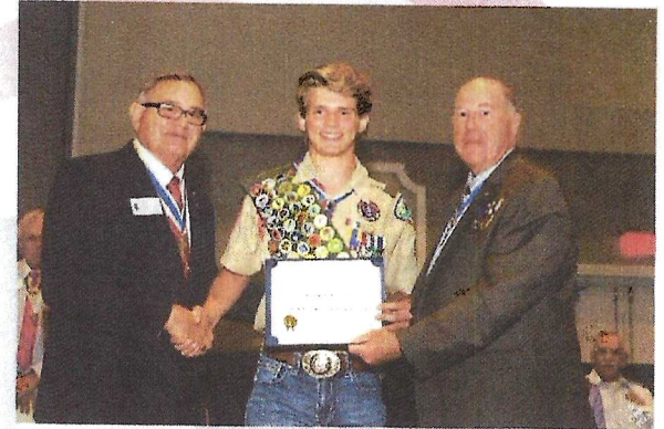
2023 Eagle Scout Winner